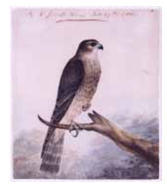
'Nero' by Emily Brontë 1841